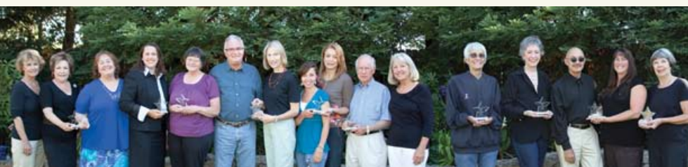
Sonoma Valley Stars Volunteers